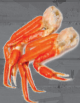
SNOW CRAB LEG